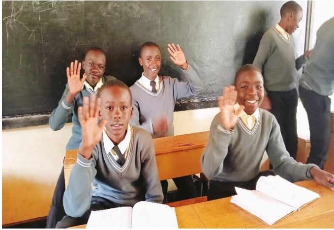
Grade seven learners